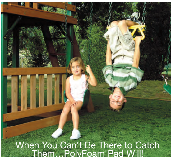
When You Can't Be There to Catch Them...PolyFoam Pad Will!

Healthier. The product is completely free of rubber and is also free of lead and other heavy metals. PolyFoam recycled polyethylene foam pad is non-microbial, which makes it resistant to bacterial and fungus growth.